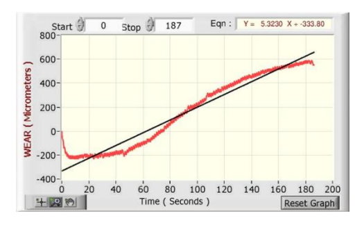
Fig. 5 Wear plot of GCI -26 at 2kg load and 3 m/s speed