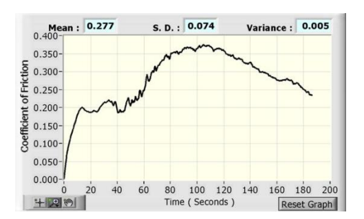
Fig. 6 COF plot of GCI -26 at 2kg load and 3 m/s speed