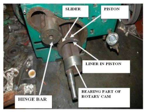
Fig.1 Components of ULVAC PKS-70

Cylindrical pins of 10 mm diameter with hemispherical tip of 5 mm diameter were fabricated from the ULVAC PKS-70 vacuum pump components. Discs 120 mm diameter and 10 mm thickness were fabricated from specially melted gray cast iron GCI-26 heat resembling the material of the rotary cam and piston of the pump in terms of composition and microstructure. Table 1 lists the POD test matrix.