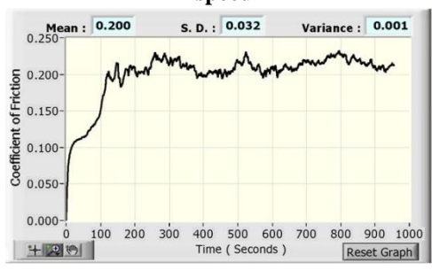
Fig. 4 COF plot of GCI -26 at 0.5 kg load and 2 m/s speed